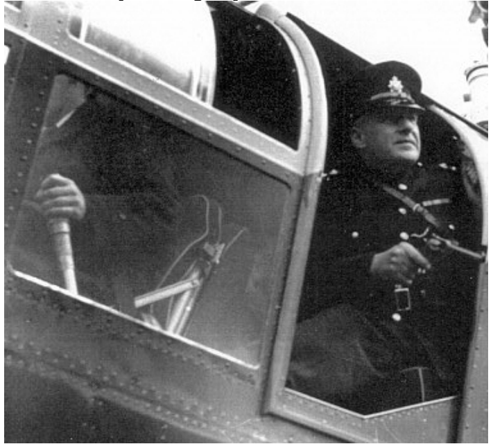
UK: June Norfolk Constabulary use a helicopter search for escaped s.

1947 WORLD: First known operational use of a helicopter to fight a forest fire took place in California [5th. August]