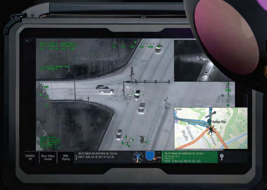
The integrated systems you need for mission success: TrakkaBeam®, TrakkaCam®, TrakkaMaps®, TrakkaStream®.