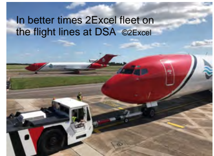
In better times 2Excel fleet on the flight lines at DSA

“We want to reiterate our support for City of Doncaster Council and the fantastic work they’ve completed so far, never losing sight of the end goal of reopening the airport by partnering with an established operator. Reopening would see 2Excel restart flight operations from Hangar 3, bringing back high-value, highly skilled and well-paid jobs to the local area and pave the way to increase our presence at the site to match our Company’s ambitious growth plans.”