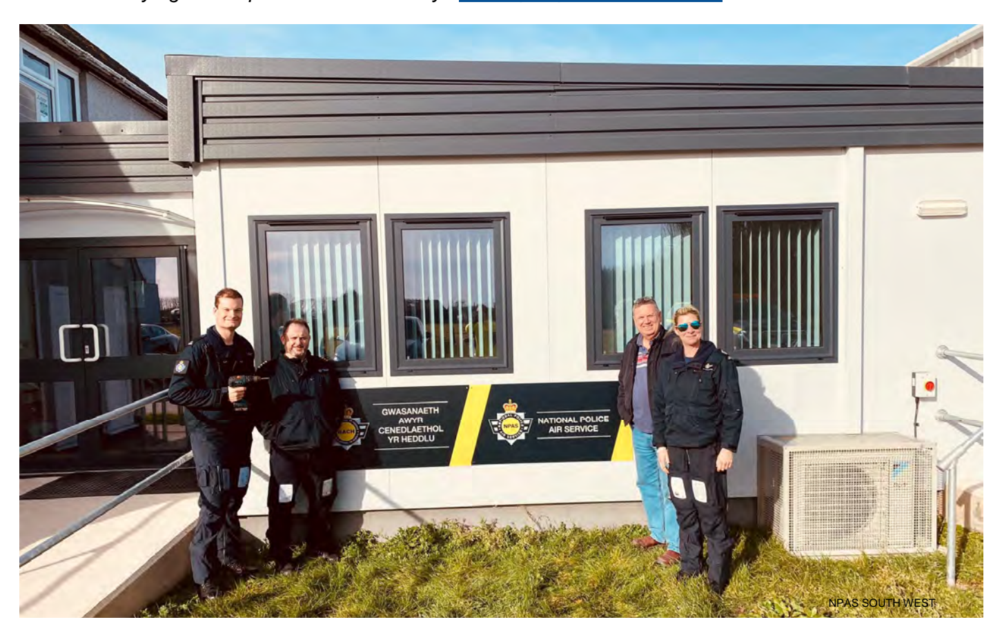
The NPAS South West base at the former RAF St Athan in Wales has had a minor upgrade in recent weeks. The base previously consisted of offices in a former house, with an adjoining hangar. There is now a new single storey building extension linking the main building to the hangar.

Any masochists among the readership might want to get up to date with the minutes of the National Strategic Board. Unannounced, six editions of the 2022 minutes have recently appeared on line on the NPAS website. No real surprises in among the text but even back a year ago there was some concern expressed about crew fatigue (as PAN highlighted last month) and the great difficulties being faced in allowing West Yorkshire to divest itself of NPAS. Still no annual report appearing though, although the minutes state that they agreed to produce one last May! <a href="https://www.npas.police.uk/about-us">www.npas.police.uk/about-us</a>