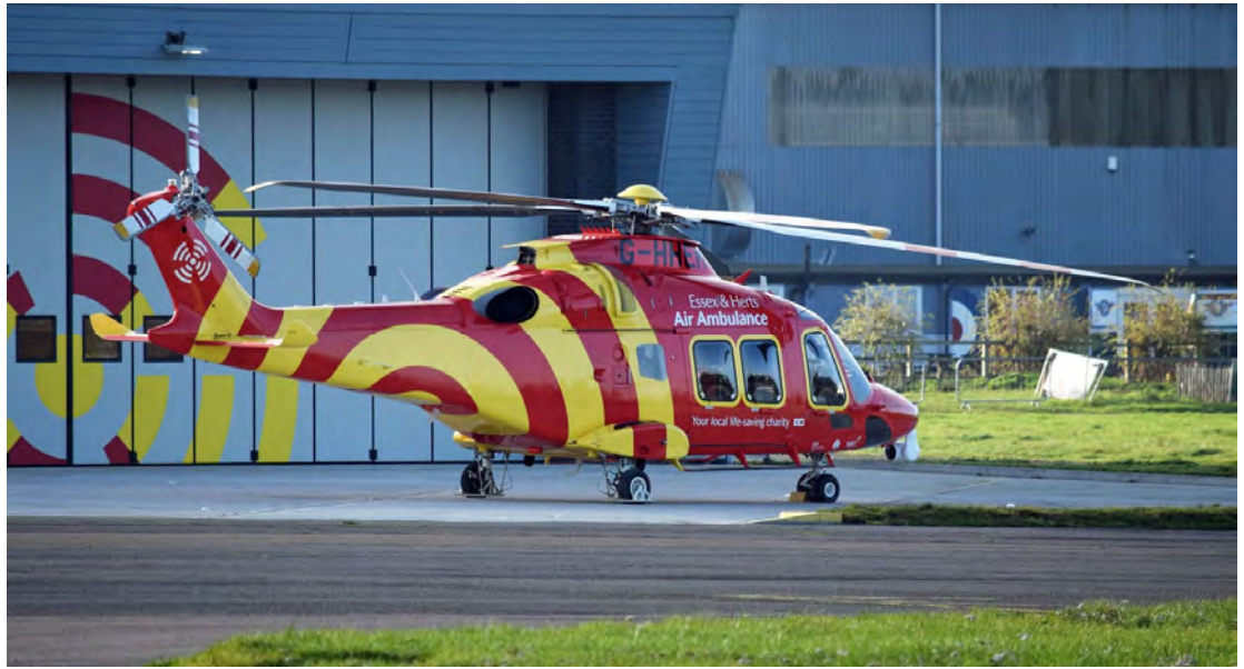
Despite having a new multi-purpose operational and visitor facility at North Weald airfield the charity continues to make use of the Ford facility at Dunton for its conference.