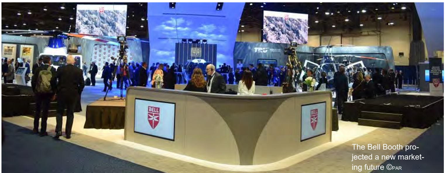
The Bell Booth projected a new marketing future

The Bell 525 Relentless advances and receives interest from customers around the world even though its prime market is still moribund. Again the delivery date has slipped so we are unlikely to see deliveries prior to 2020 .