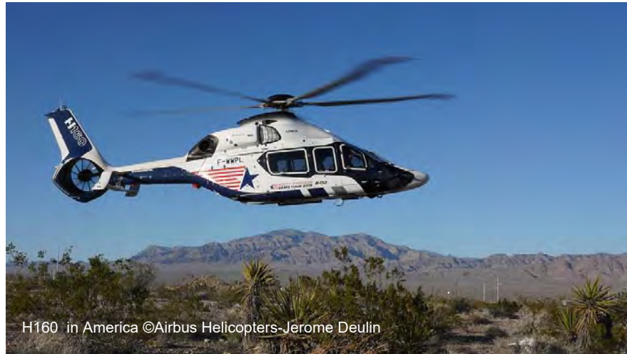
H160 in America

Maintenance demos on the H160 were performed daily to demonstrate how maintenance has been optimised and facilitated thanks to the latest thoughts on design. Alongside the second prototype of the H160 the company displayed its HGeneration range of mission enablers including HCare services that allow customers to focus on safely, efficiently and cost-effectiveness. Also on display were an LAPD H125 in a law enforcement configuration, the H135 equipped with Helionix, and the H145 in a private and business aviation configuration.