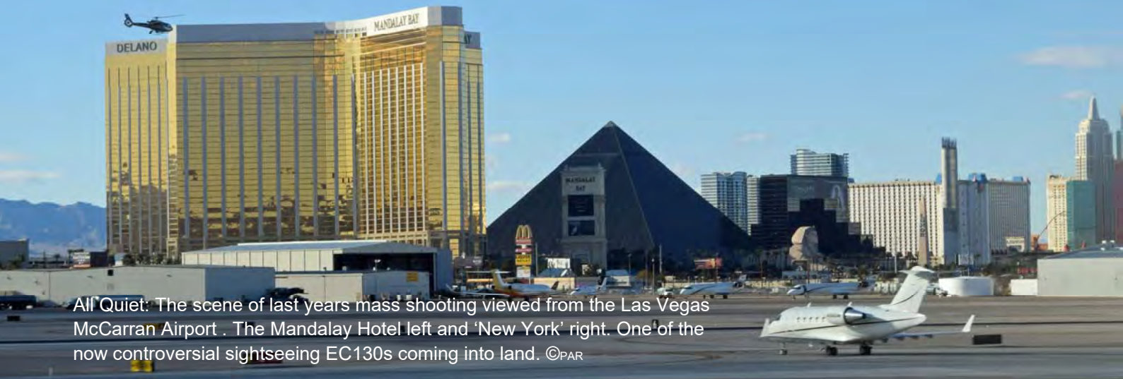
All Quiet: The scene of last years mass shooting viewed from the Las Vegas McCarran Airport. The Mandalay Hotel left and 'New York' right. One of the now controversial sightseeing EC130s coming into land.