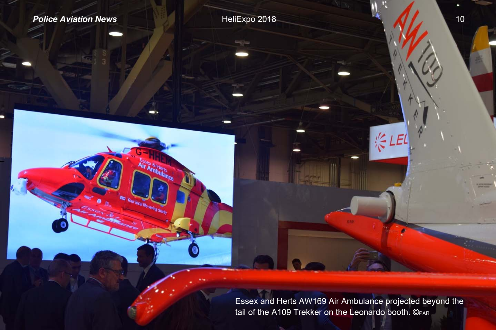
Essex and Herts AW169 Air Ambulance projected beyond the tail of the A109 Trekker on the Leonardo booth.