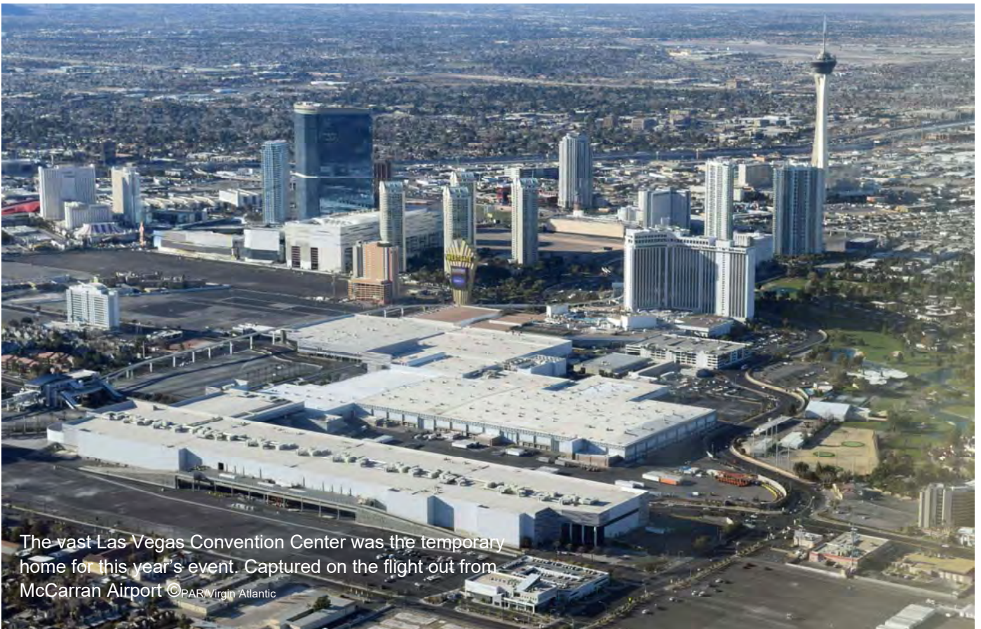
The vast Las Vegas Convention Center was the temporary home for this year's event. Captured on the flight out from McCarran Airport