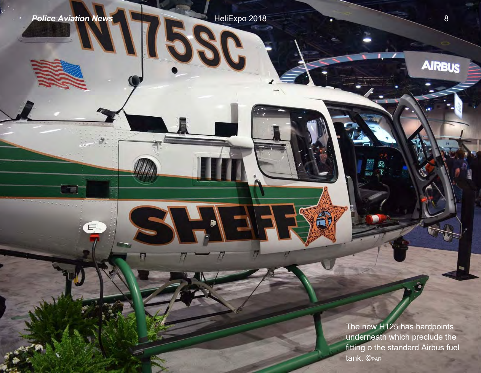
The new H125 has hardpoints underneath which preclude the fitting of the standard Airbus fuel tank.

Another near unique US built product is the H125 which remains popular with the US police – notwithstanding the query over the upgraded fuel tank. Metro were displaying N175SC the latest H125 for the Seminole County Sheriff based at Sanford Airport, Orlando, Florida.