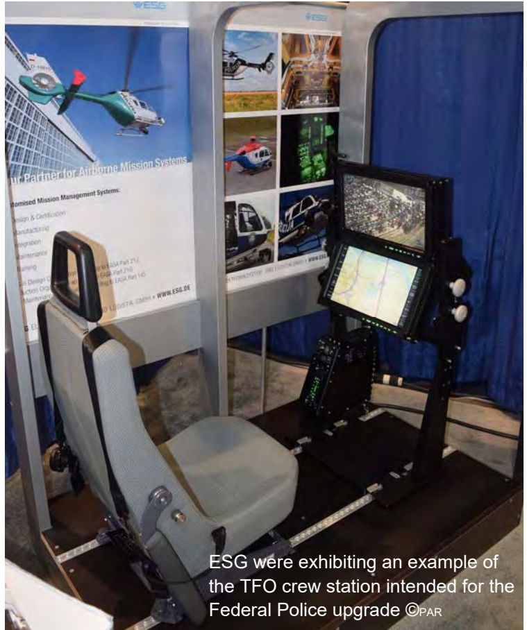
ESG were exhibiting an example of the TFO crew station intended for the Federal Police upgrade

The Missions Management System ESGMM supports the operator with a fusion of map data, terrain models, real-time video and databases of geo-referenced objects. ESGMM has wide-ranging interfaces to avionic systems such as the Electro-Optical System (EOS), Automated Identification System (AIS), High Definition (HD) Video Downlink, Intercom, Cockpit MFDs, GPS, radar altimeters and FMS. ESG has integrated the new Hensoldt Argos-II HD as the EO/IR system [replacing FLIR supplied systems in the main]. South Africa based Hensoldt is the most recent identity of Denel/Zeiss/Airbus DS.