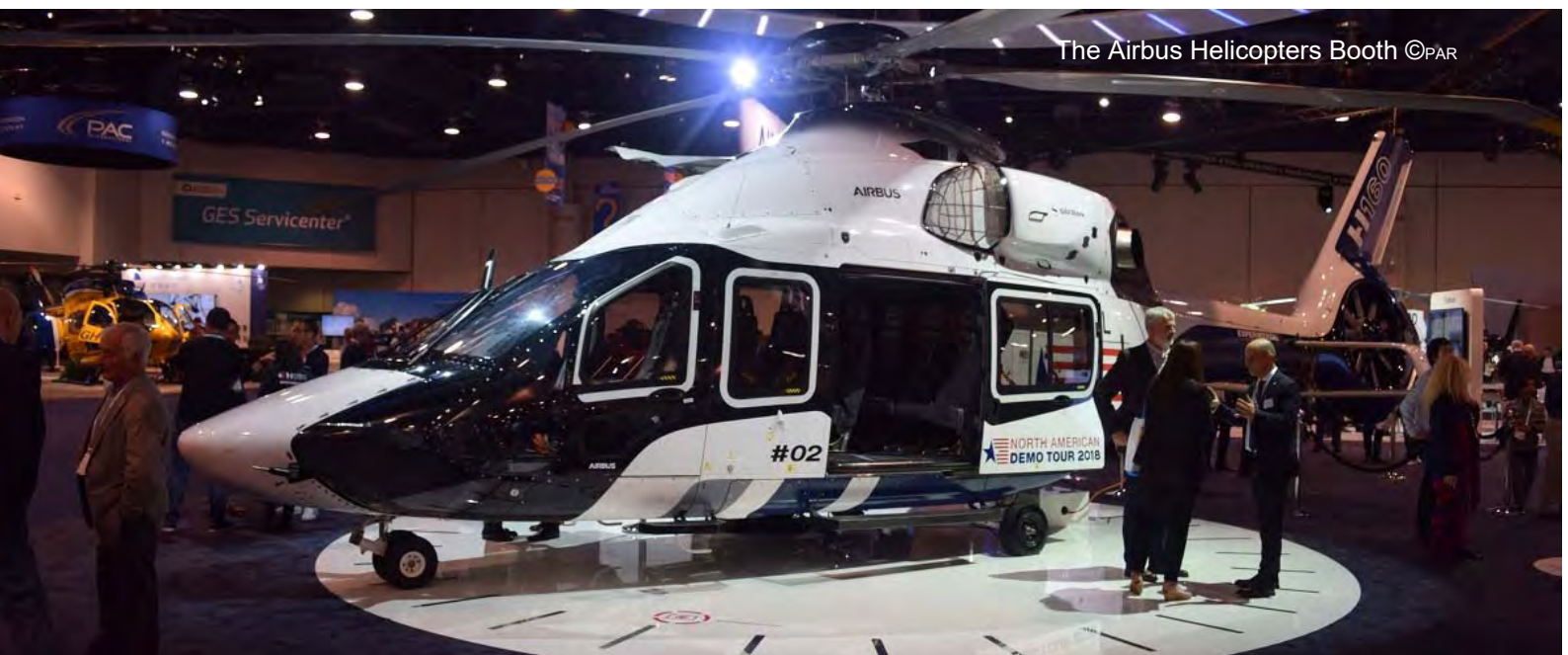
The Airbus Helicopters Booth