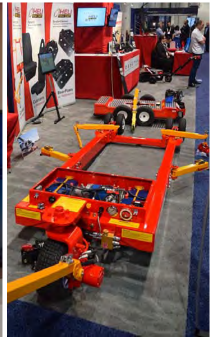
As the picture below indicates Helicopter Association International looks forward to seeing everyone in Atlanta, March 4-7 2019