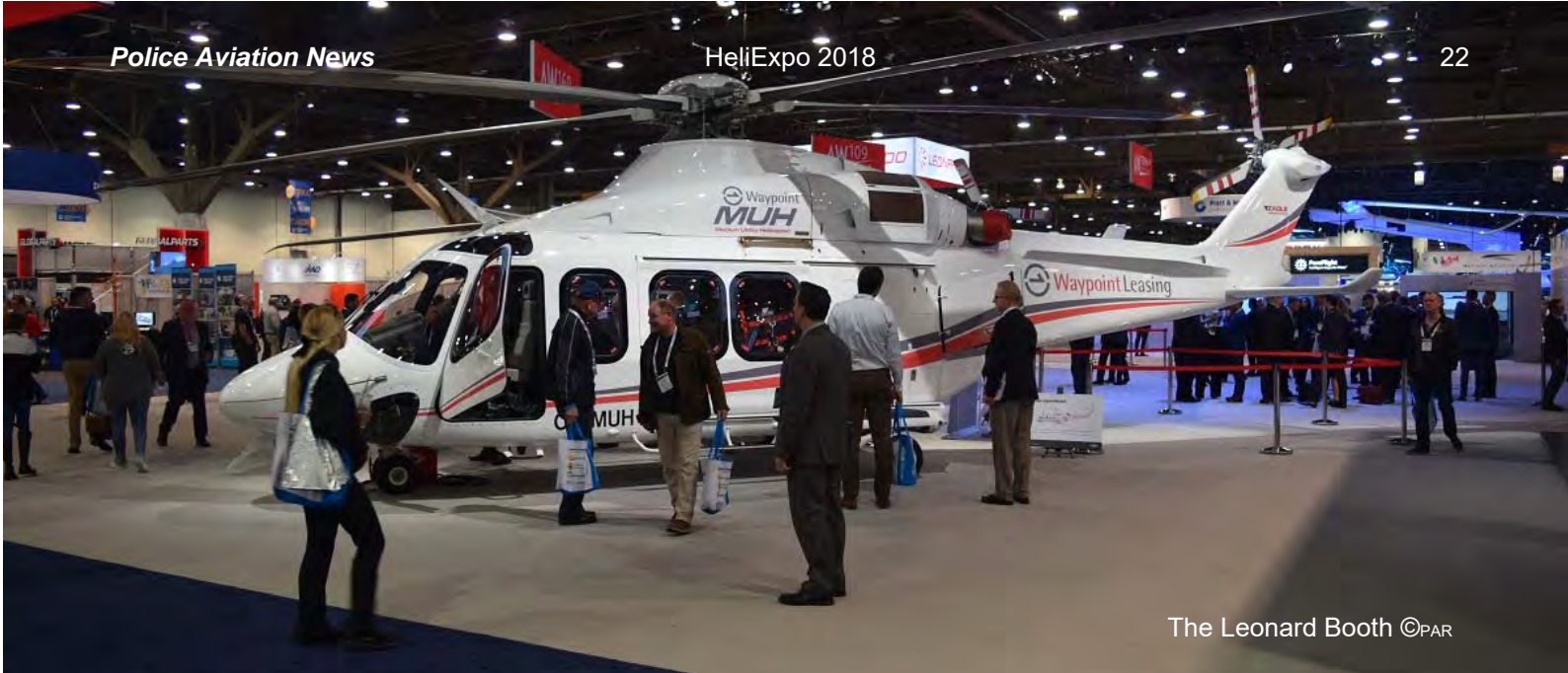
The Leonard Booth