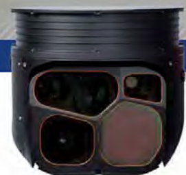
Star SAFIRE® 380-HDc

FLIR Systems continues to redefine what's possible with the new Star SAFIRE™ 380HDc. Unmatched multi-spectral HD imaging in a light, compact, low profile system designed for your Law Enforcement mission.