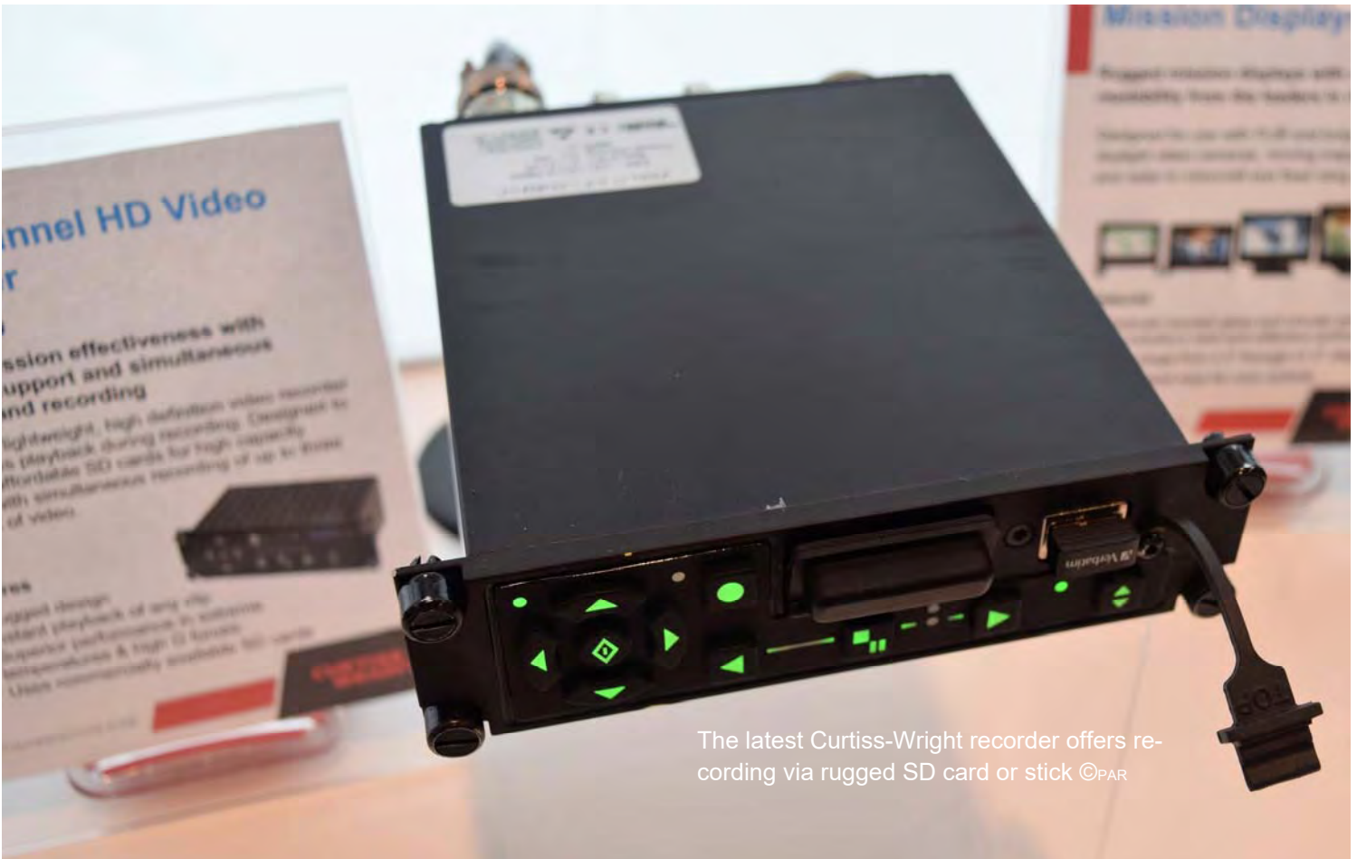
The latest Curtiss-Wright recorder offers recording via rugged SD card or stick